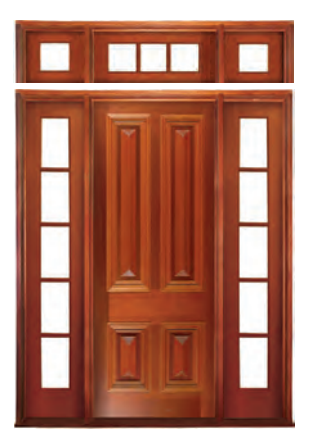
Cricket Bat Entrance with Transom 2550 x 1775 - $4420 without Transom 2100 x 1775 - $3485