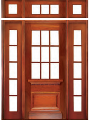
Hampshire Entrance with Transom 2610 x 1875 - $4907 without Transom 2160 x 1875 - $3949