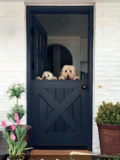
Our Hampton Cross Brace doors are designed to allow conversion to a stable door (or dutch door) if required at the additional cost of $250