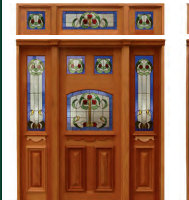
Queen Anne Entrance with Transom

Size 2100 x 1200 x 45 $1711 2340 x 1200 x 45 $1927