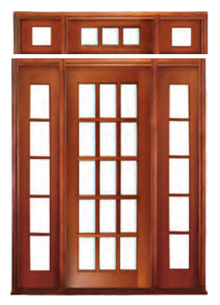
Glazed Entrance with Transom 2550 x 1775 - $4152 without Transom 2100 x 1775 - $3217

All prices shown allow for clear glass, unless stated otherwise, but do not include architraves, white priming, hardware or delivery.