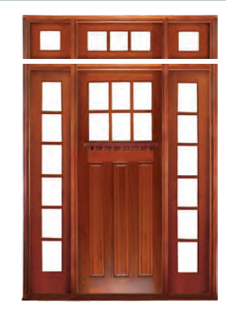
Ashgrove Entrance in Hampton Frame with Transom 2550 x 1775 - $4302 without Transom 2100 x 1775 - $3367