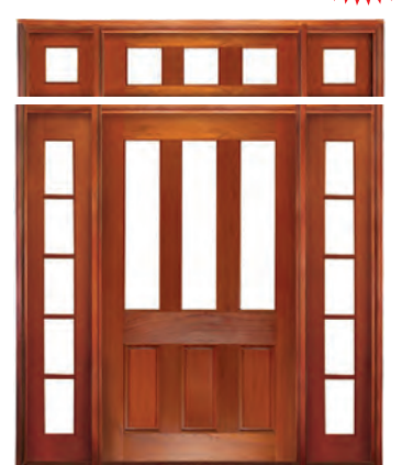
Vermont Entrance with Transom 2610 x 2155 - $5449 without Transom 2160 x 2155 - $4493

All prices shown allow for clear glass, unless stated otherwise, but do not include architraves, white priming, hardware or delivery.