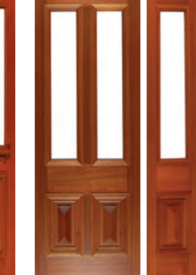
Glazed Cricket Bat

Size 2040 x 820 x 40 $1062 2040 x 410 x 40 $744 with triple glazed leadlight 2040 x 820 x 40 $1595 2040 x 410 x 40 $1206