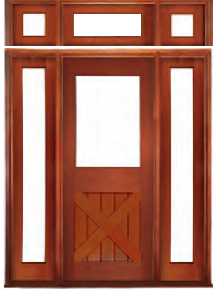
1 Light Hampton Cross Brace Entrance with Transom 2610 x 1875 - $4289 without Transom 2160 x 1875 - $3366